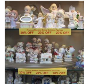
SUMMER SALE on in-store items only. Please visit our store at 8562 Mentor Ave Mentor, Ohio 44060

Figurines, Angels, and Hanging Ornaments, Seraphim Angel Classics, and more. You will find a wide assortment of books, posters, jewelry, wall art and other Christian related gifts also on sale. Cash in your DOVE DOLLARS for additional savings! Help us make room for new items arriving this fall.